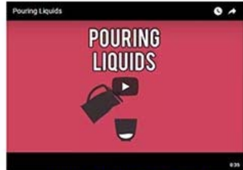
Increase Contrast When Pouring Liquids

Welcome to this week's QuickCare Tip Video. Click on the image below to view this and other no / low cost ideas that provide easy solutions to common, everyday problems.